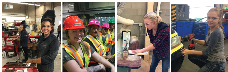
OKANAGAN COLLEGE WOMEN IN TRADES TRAINING

https://centralokanagan.schoolcashonline.com/